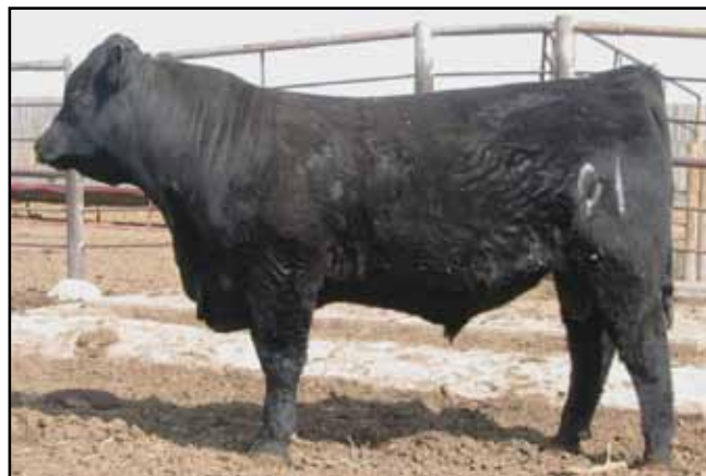
GA WHITMAN 510

A TC Freedom son that we purchased at the Cattlemen's Classic in Kearney. Just like his sire he passes on the stylish look along with the extra muscle, hip and top. His dam is a 1407 daughter which should add the maternal and carcass traits. We kept several of Whitman's daughters to add back to our cowherd and they appear to have excellent udders.