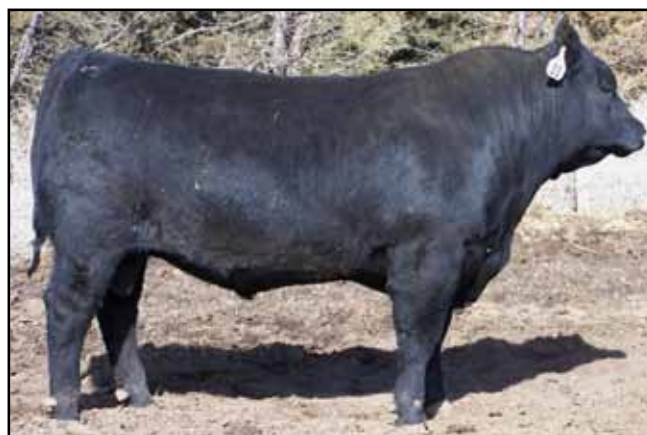
SCC LEGEND 542

We purchased Legend from Lee Cattle Company as primarily a heifer bull and he has definitely filled that goal, but along with that he is an easy fleshing individual packed with lots of meat and seems to pass it on to his offspring. He is a moderate framed bull that phenotypically looks just like his sire OCC Legend 616L with a big hip and lots of volume.