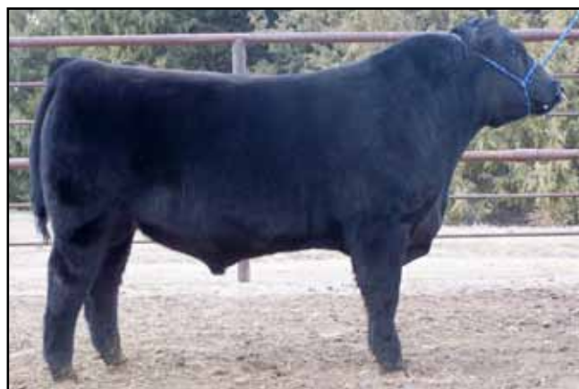
LEE'S OUTLINE 7047

One of our newer herdsires that adds tremendous volume and thickness to his offspring. There are several good sons by him in this sale. He is one of the better herdsires we have ever owned as far as disposition goes.