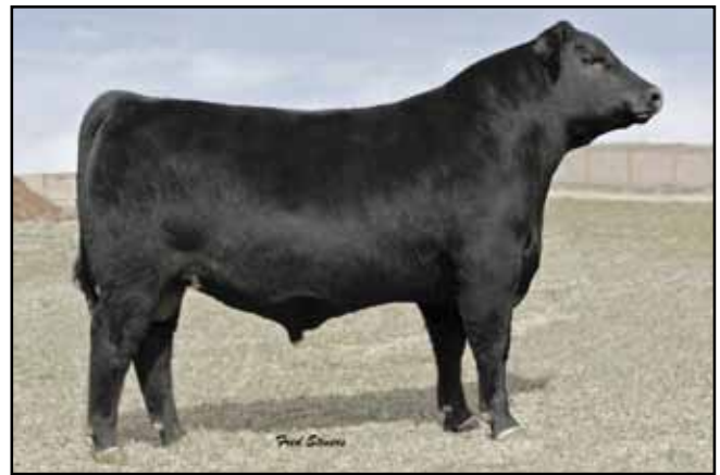
TC TOTAL 410

A very docile attractive sire that sires those calves that flat out put on the pounds. He had some of the highest weaning weight bulls in this year's sale. He adds pounds to both the WW & YW EPDs along with tremendous Milk. He is also known for his marbling capabilities as he had an IMF scanning ratio of 199 as a yearling.