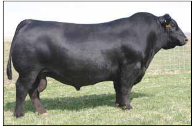
S A V NET WORTH 4200

A very popular AI Sire that is a powerhouse to add pounds and mass to his offspring. He also sires tremendous milk and carcass traits. He is the sire to one of our new Balancer Herdsires (EGL U409).