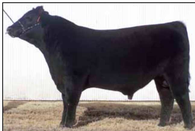
HOPPS LOOK AT ME 745

A herdsire that makes his offspring long, stylish and square hipped. His sons in this sale have performed very well while on their dams and had very good post weaning gains.